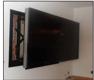
Actual 108" Extending Scissor MegaMount™